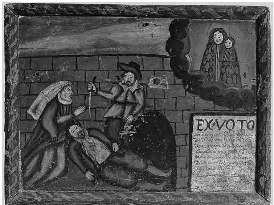
Figure 3. Apunyalament d'un home davant de la porta de l'església, Solsona 1626. Santuari del Miracle, Riner.

Nor did it end in the rest of Catalonia because there were more borders, such as the banks of the Ebro River, which has been studied very little to date. This border with the Kingdom of Valencia witnessed many events, as did Viceroy Francesc de Borja when he reached Tortosa, the gateway to Catalonia in the south, in 1539. As he swore an oath to the constitutions of the Principality he said, with reference to the castle of Tortosa “ que en lugar de ser reyno y defensa de los vasallos de V. M. no sirve sino